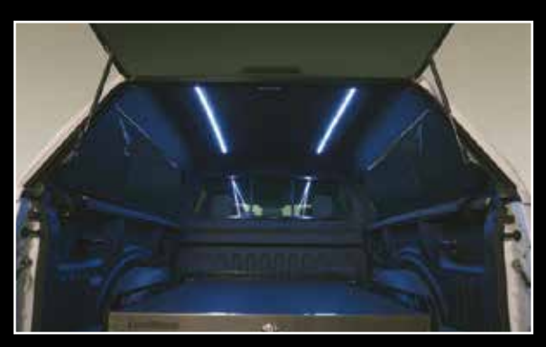
Light up the interior of your cap with optional LED Strip Lights