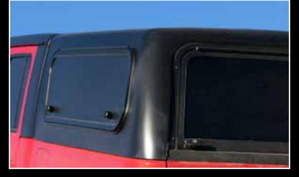
Optional Matte Black paint finish