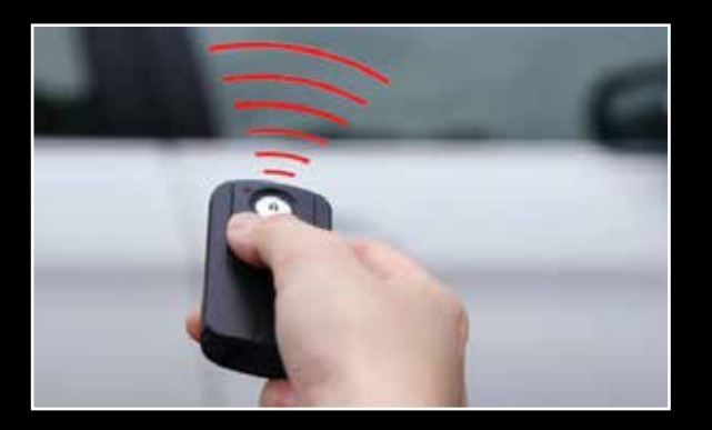
Optional Keyless Remote System unlocks cap rear door with your truck's remote key