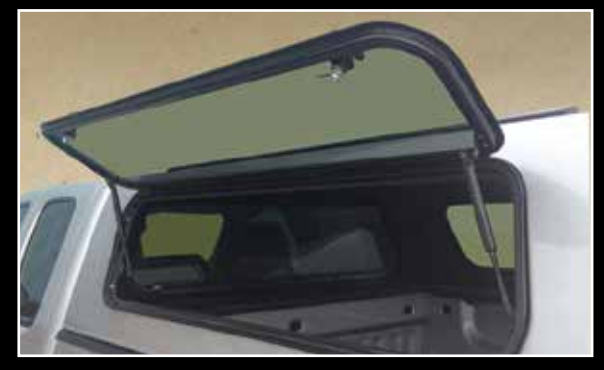
Optional side Windoor provides added access to cap interior