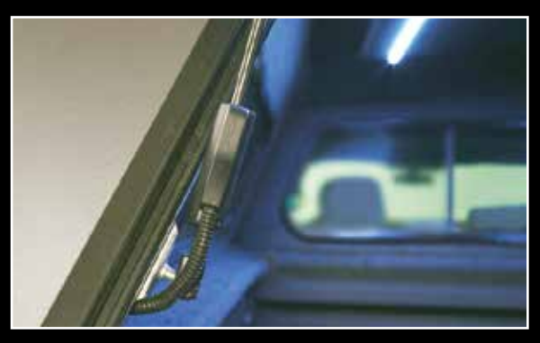
Optional Switch for Auto On/Off Lighting