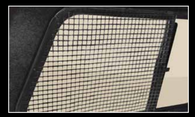
Optional Pet Screen allows fresh air ventilation and keeps pets inside