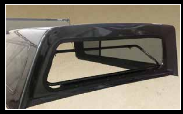
Optional cap tilt down Hinged Front Window allows access to wash back window of truck