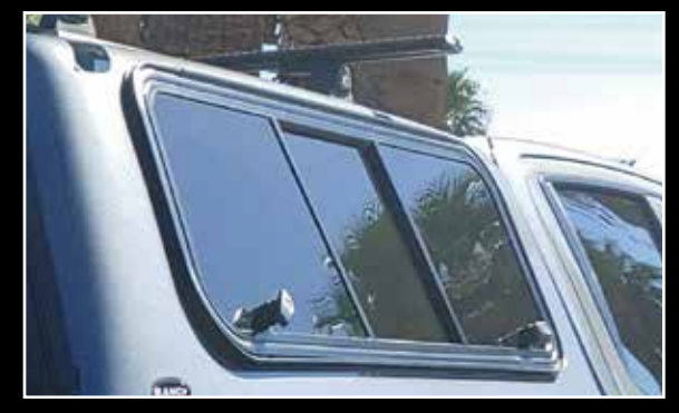
Optional side Windoor with Slider provides ventilation without opening the entire Windoor