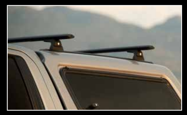
Optional Roof Rack Systems for extra carrying capacity